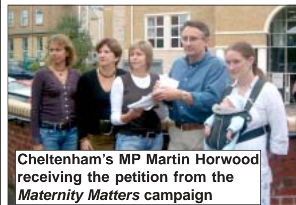
Cheltenham's MP Martin Horwood receiving the petition from the Maternity Matters campaign

On Friday September 15th, Cheltenham's Member of Parliament, Martin Horwood received a petition of 10,000 names from the Cheltenham Maternity Matters campaign calling for St Paul's maternity wing to be kept open.