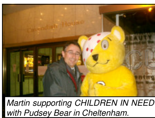
Martin supporting CHILDREN IN NEED with Pudsey Bear in Cheltenham.

Member of Parliament for Cheltenham and Liberal Democrat charities spokesman Martin Horwood has told the House of Commons 'charity should mean charity'. The Cheltenham MP, who has worked himself for charities like Oxfam and the Alzheimer's Society , was speaking on the final stages of the Charities Bill which includes measures to make life more straightforward for charity treasurers and administrators. He told MPs about local charities including the National Star College and Cheltenham Community Projects and said many measures in the bill would help them when it became law.