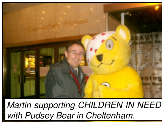
Martin supporting CHILDREN IN NEED with Pudsey Bear in Cheltenham.

Member of Parliament for Cheltenham and Liberal Democrat charities spokesman Martin Horwood has told the House of Commons 'charity should mean charity'. The Cheltenham MP, who has worked himself for charities like Oxfam and the Alzheimer's Society , was speaking on the final stages of the Charities Bill which includes measures to make life more straightforward for charity treasurers and administrators. He told MPs about local charities including the National Star College and Cheltenham Community Projects and said many measures in the bill would help them when it became law.