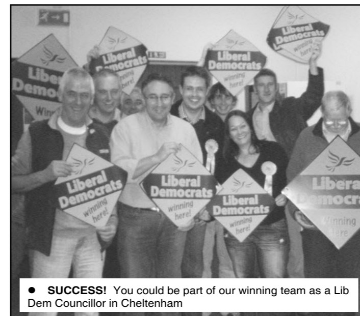
● SUCCESS! You could be part of our winning team as a Lib Dem Councillor in Cheltenham

I am enjoying my time at Martin Horwood's offices, and I would strongly recommend it as a work experience placement. I have learned plenty in the short time that I have been here, and I am thoroughly looking forward to the rest of the week.